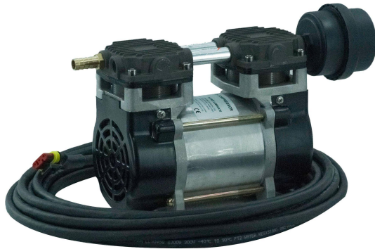
RPS AIR COMPRESSOR WITH DC BRUSHLESS MOTOR WITH AIR INTAKE FILTER