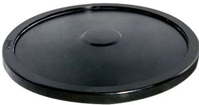
7" WEIGHTED DIFFUSER MEMBRANE AIR STONE

Solar panel mounting is not included in the standard RPS AIR system, you can purchase one of our easy-to-install Top of Pole mounts for a complete DIY experience. The compressor should be protected from the elements with some sort of cover, customer provided.