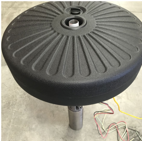
Place float on the pump around the Nipple. Just enough of the thread will come through the middle to allow for threading on your fountainhead nozzle (If the F400, place the Plastic Disk around before nozzle)