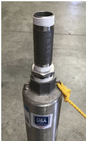
Thread on the Threaded Nipple to your Pump w/ Bushing